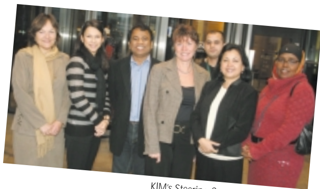
KIM's Steering Committee 2006–2009.