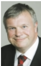
Bjarne Håkon Hanssen, Minister of Labour and Social Inclusion.

The Contact Committee for Immigrants and the Authorities (KIM) is an important and useful body for discussion and dialogue on policy matters of concern to Norway's immigrant community.